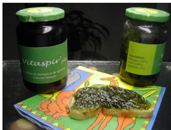
Vitaspir project: spirulina marmalade