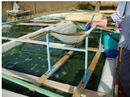
Spirulina exploitation: filtration

The production process is relatively easy and can be done by village people. Regularly the water of the basins has to be blended to prevent spirulina to enter in dormancy. Every day, spirulina is harvested with large filters which keep the spirulina and release the water. Then spirulina is pressed and dried in threads which will be conserved before the use.