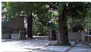
Tokyo NODAI with 125 years history is honored to welcome ISSAAS members